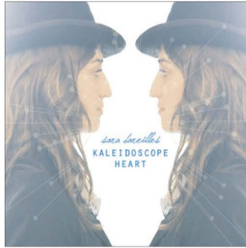
SARA BAREILLES 'KALEIDOSCOPE HEART' Epic Records Mixed and Produced by Neal Avron Chart Debut Sept 14, 2010