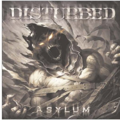
DISTURBED 'ASYLUM' Warner Brothers Mixed by Neal Avron Chart Debut Sept 7, 2010

NOTED PRODUCER/MIXER NEAL AVRON DELIVERS THE #1 BILLBOARD MAGAZINE CHART DEBUT ALBUM FOR THREE CONSECUTIVE WEEKS